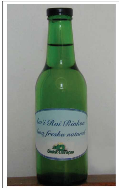
Figure 3. A bottle of groundwater (from spring at Roi Rinkon, Curaçao) given as a gift to remember that this was once a usable resource on the island (Water for Life Conference, Curaçao 2003). The front label (in Papiamentu) reads “Awa fresku natural” (Natural fresh water). However, as the aquifer is contaminated, a label on the backside of the bottle reads “Not for consumption.”

In arid and semi-arid areas, water is an especially precious commodity. In Israel, water scarcity was the trigger for considering rain water recharge at home-scale level (e.g., by directing infiltration of rain water falling on the roofs into the subsurface) as a worthwhile water-saving approach. This may be an appealing methodology if the unsaturated zone is analyzed for the existence