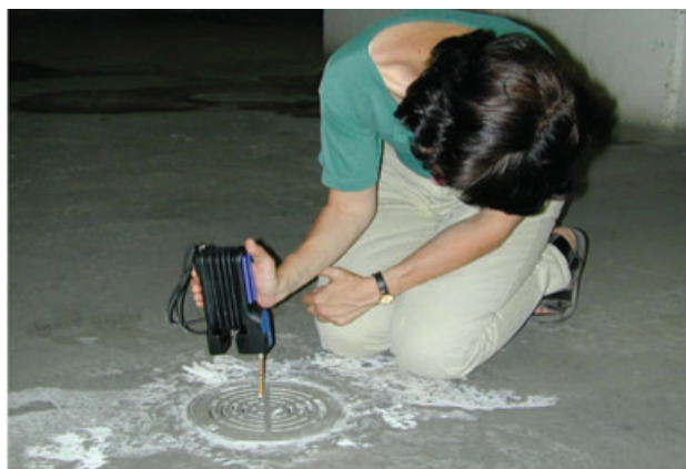
Figure 1. Measuring 822,000 µg TCE/m 3 air emanating from a water drain in an underground parking lot of a building located in a VOC contaminated area of the Coastal Plain aquifer of Israel (Israel maximum level for 24-h exposure = 1000 µg TCE/m 3 air). The drain opening is about 5 m above the water table (water table depth ~18 m below ground surface; after Graber et al. 2000). The building is located about 500 m from monitoring well M5A (Figure 4). Note that volatilization is considered to be one of the natural attenuation processes.

Thus, we postulate that neither “brute-force cleansing” nor “natural attenuation” can be adopted uncritically, and that either approach requires prior quantitative analysis of likelihood of success based on available